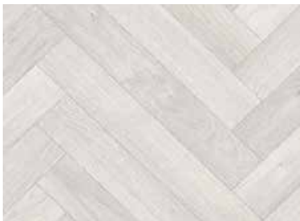
Image Silver tile