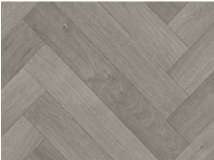
Image Silver tile