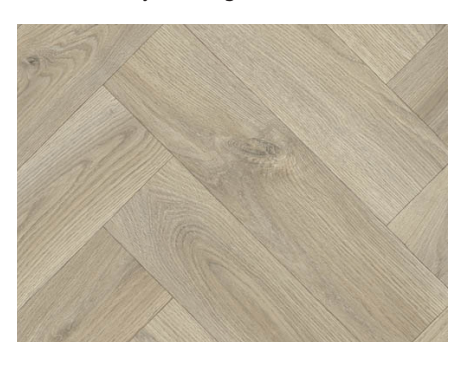
B701N Abbey flooring