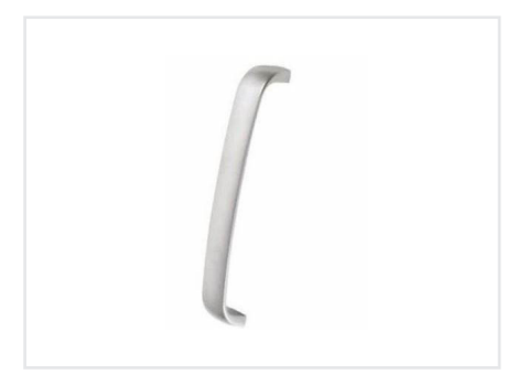
HPK671 nickel wide bow handle