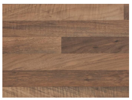
Oak Block worktop