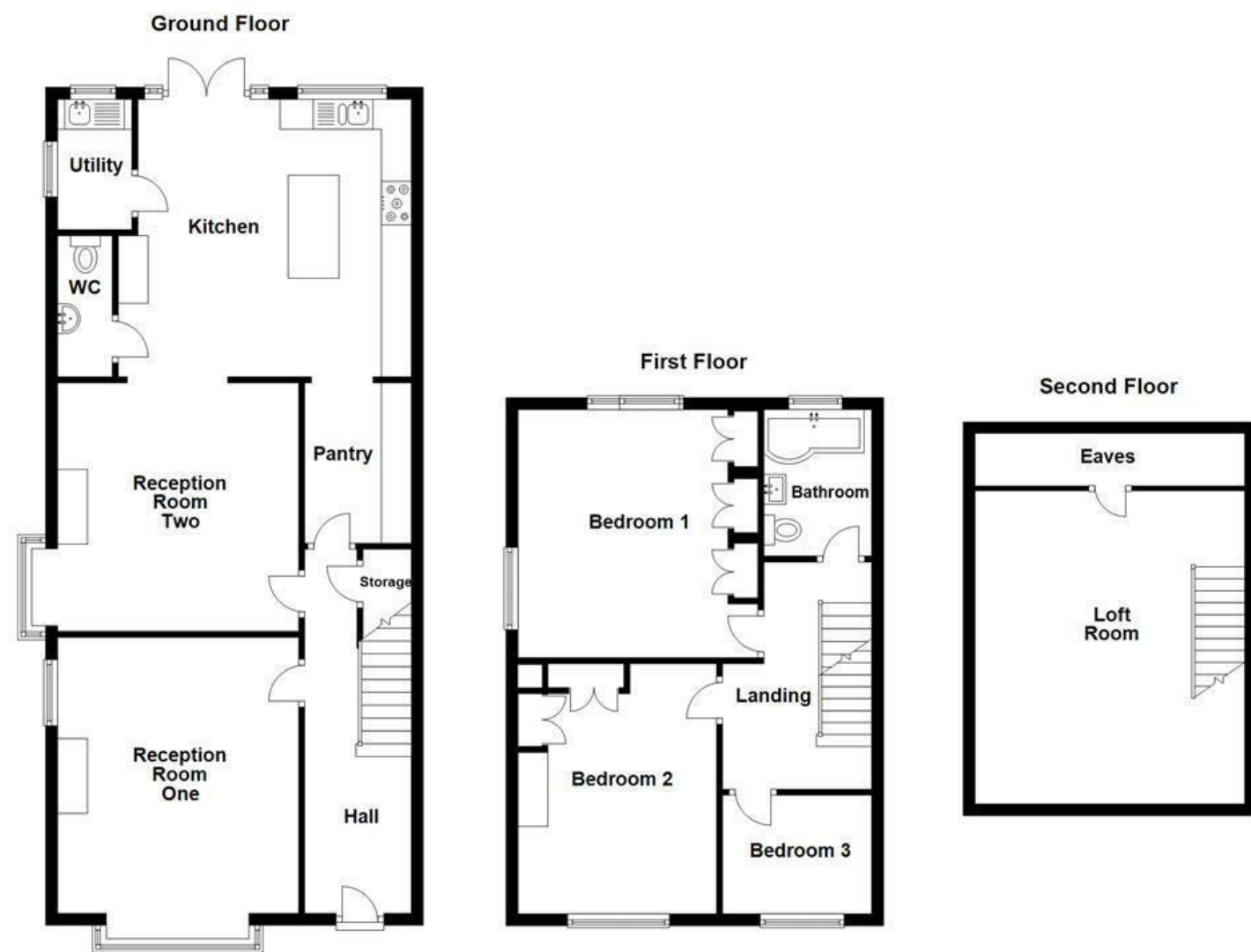
All floorplans are for guidance only. Not to scale. Please check all dimensions and shapes before making any decisions reliant upon them. Plan produced using PlanUp.