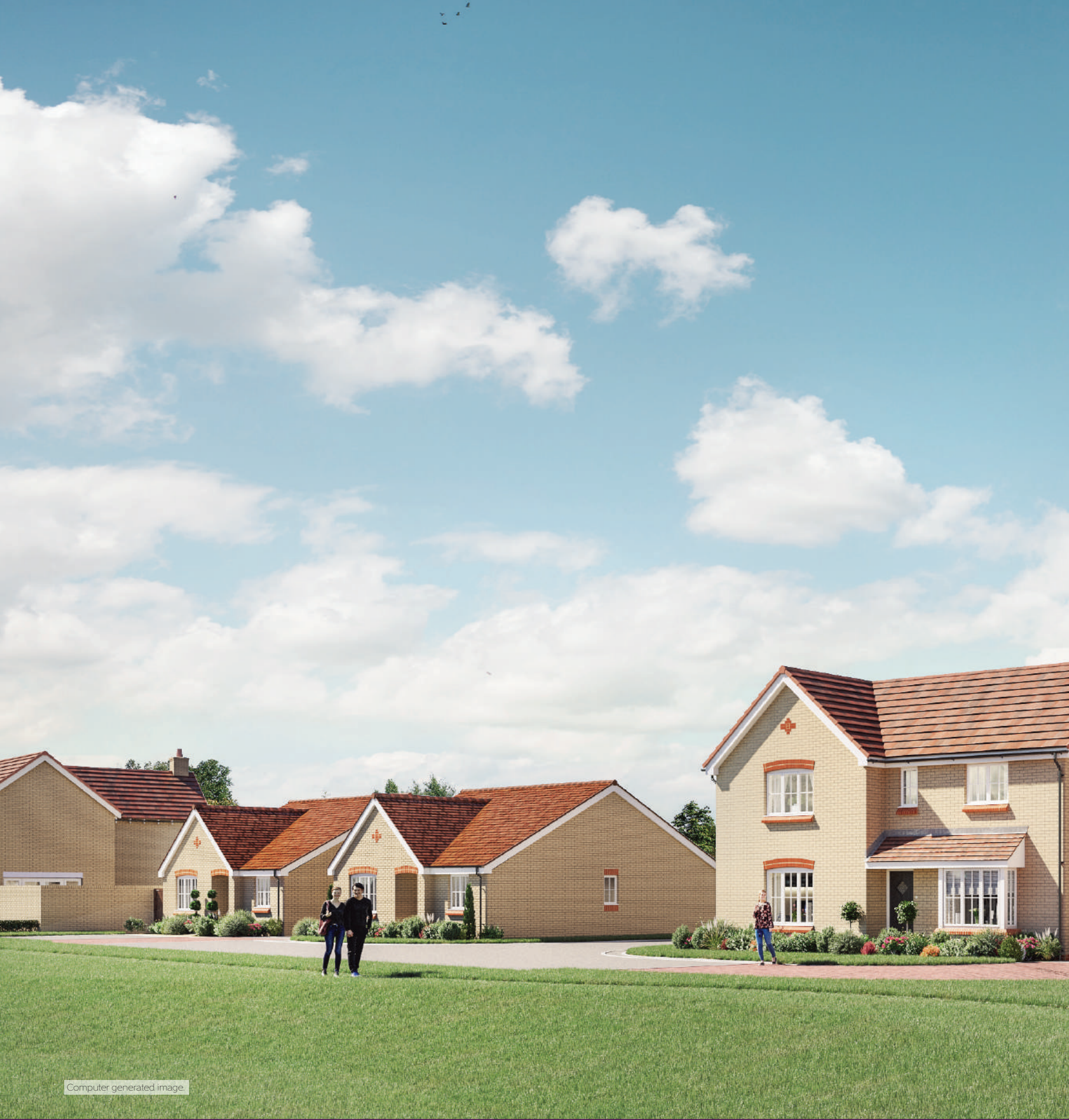
Computer generated image.