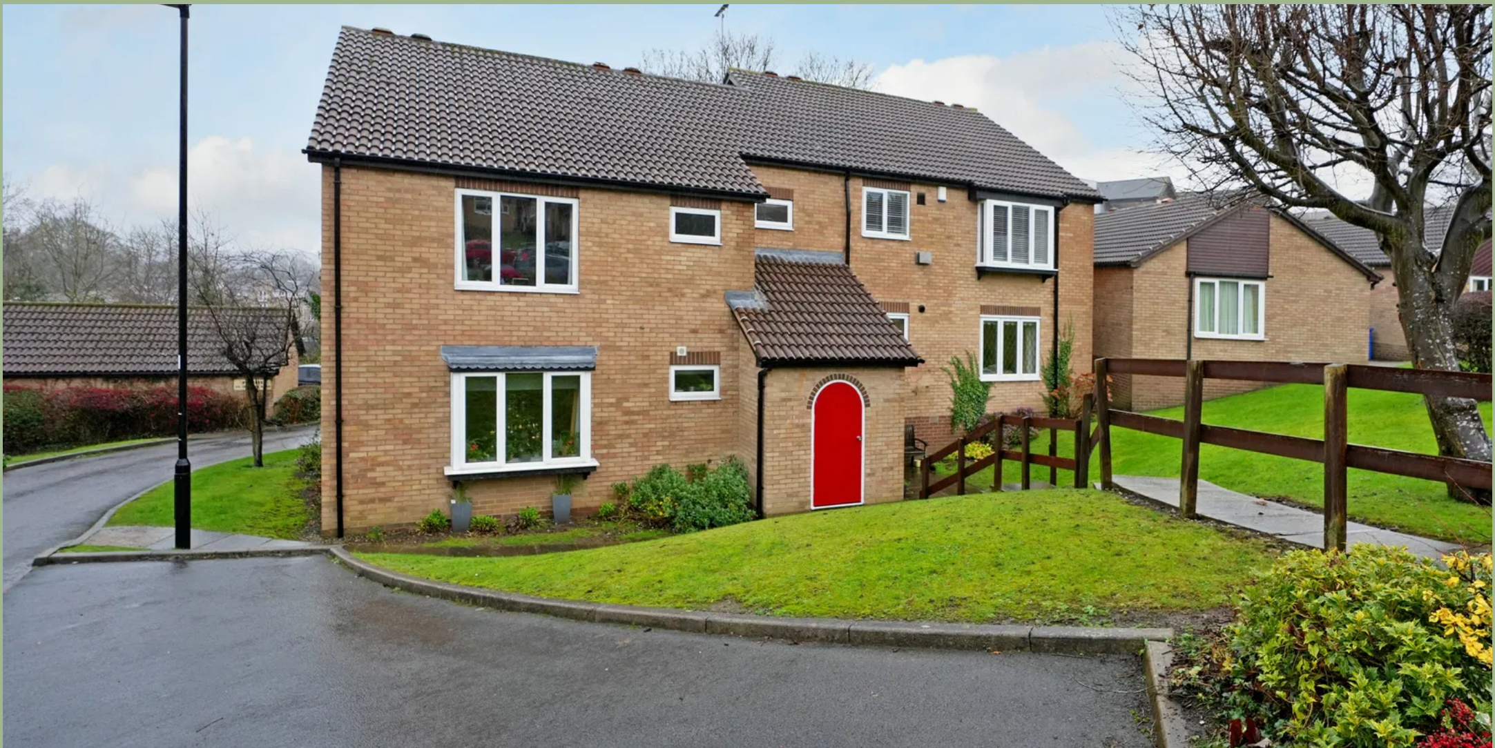
Ryefield Gardens, Ecclesall, Sheffield Sheffield