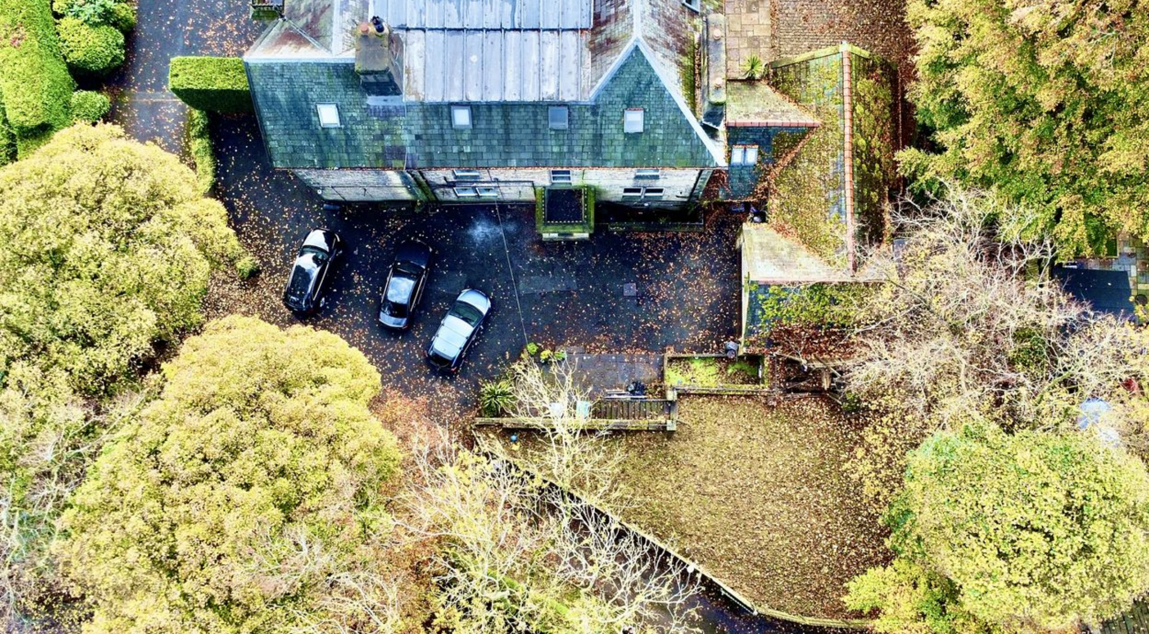
The Gables, Upper Syke, Clayton Lane, Clayton