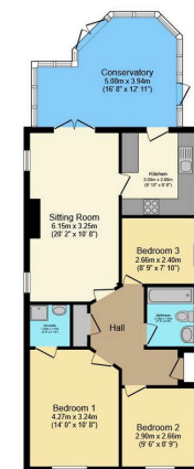
Floor Plan Floor area 89.5 m 2 (964 sq.ft.)