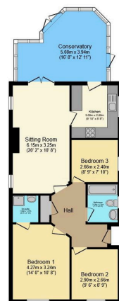
Floor Plan Floor area 89.5 m 2 (964 sq.ft.)