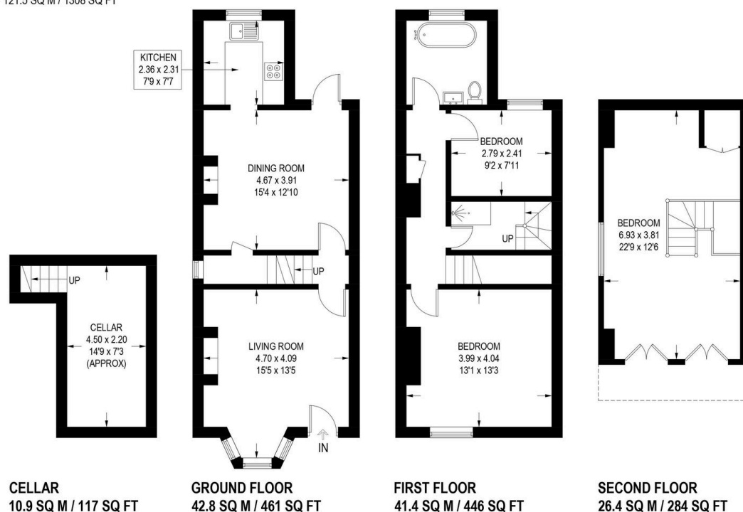
Illustration for identification purposes only. measurements are approximate, not to scale.

APPROXIMATE GROSS INTERNAL AREA = 110.6 SQ M / 1191 SQ FT CELLAR = 10.9 SQ M / 117 SQ FT TOTAL = 121.5 SQ M / 1308 SQ FT