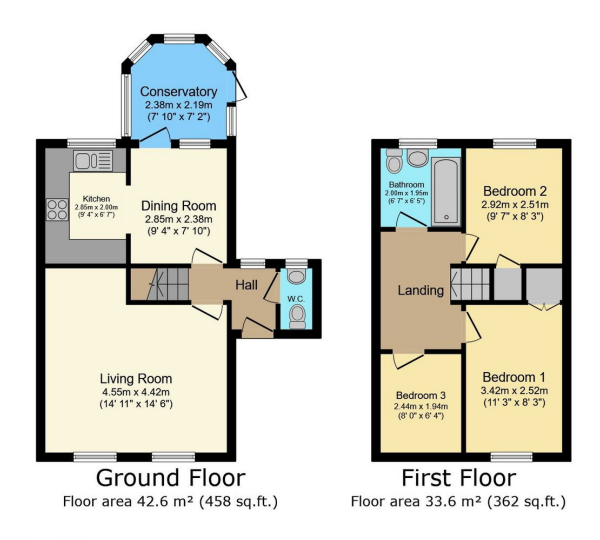
TOTAL: 76.2 m<sup>2</sup> (820 sq.ft.)