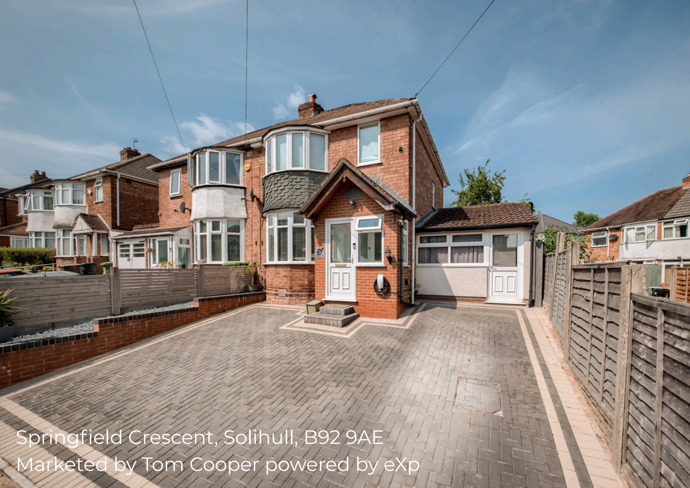
Springfield Crescent, Solihull, B92 9AE Marketed by Tom Cooper powered by eXp