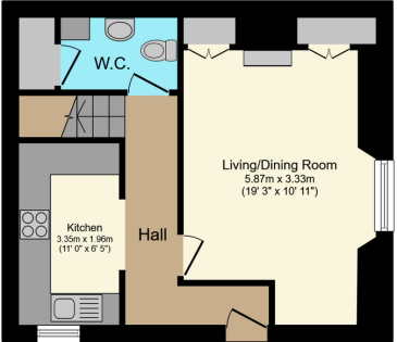
Ground Floor Floor area 39.3 sq.m. (423 sq.ft.)