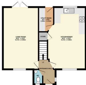
GROUND FLOOR 582 sq.ft. (54.1 sq.m.) approx.