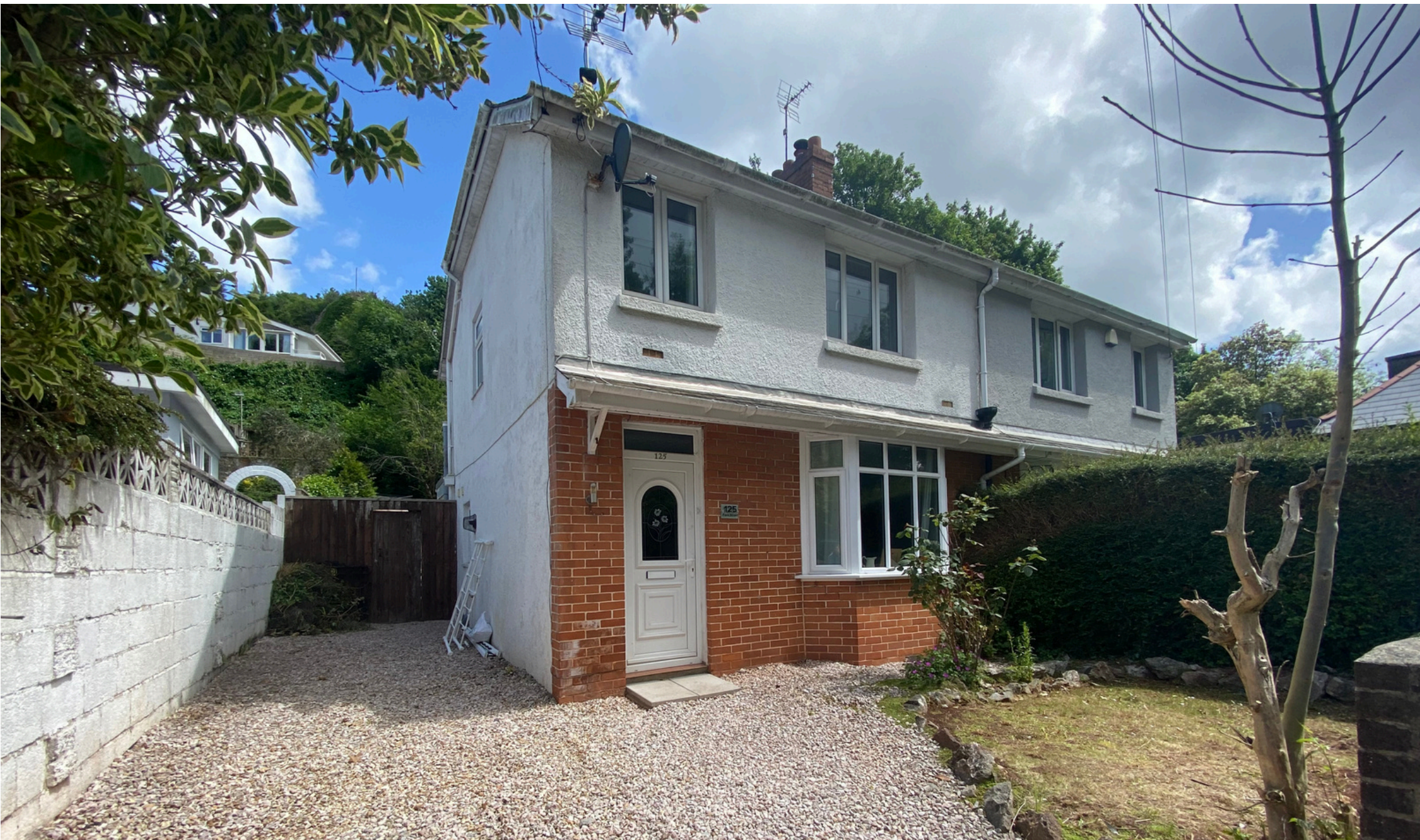
Fore Street, Torquay Guide Price £300,000 to £310,000