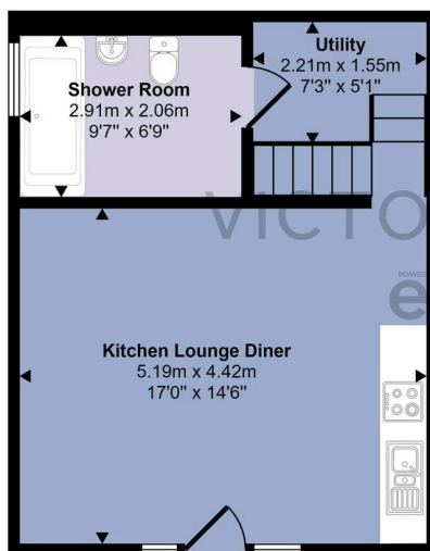
Ground Floor Approx 35 sq m / 380 sq ft

Approx Gross Internal Area 52 sq m / 555 sq ft