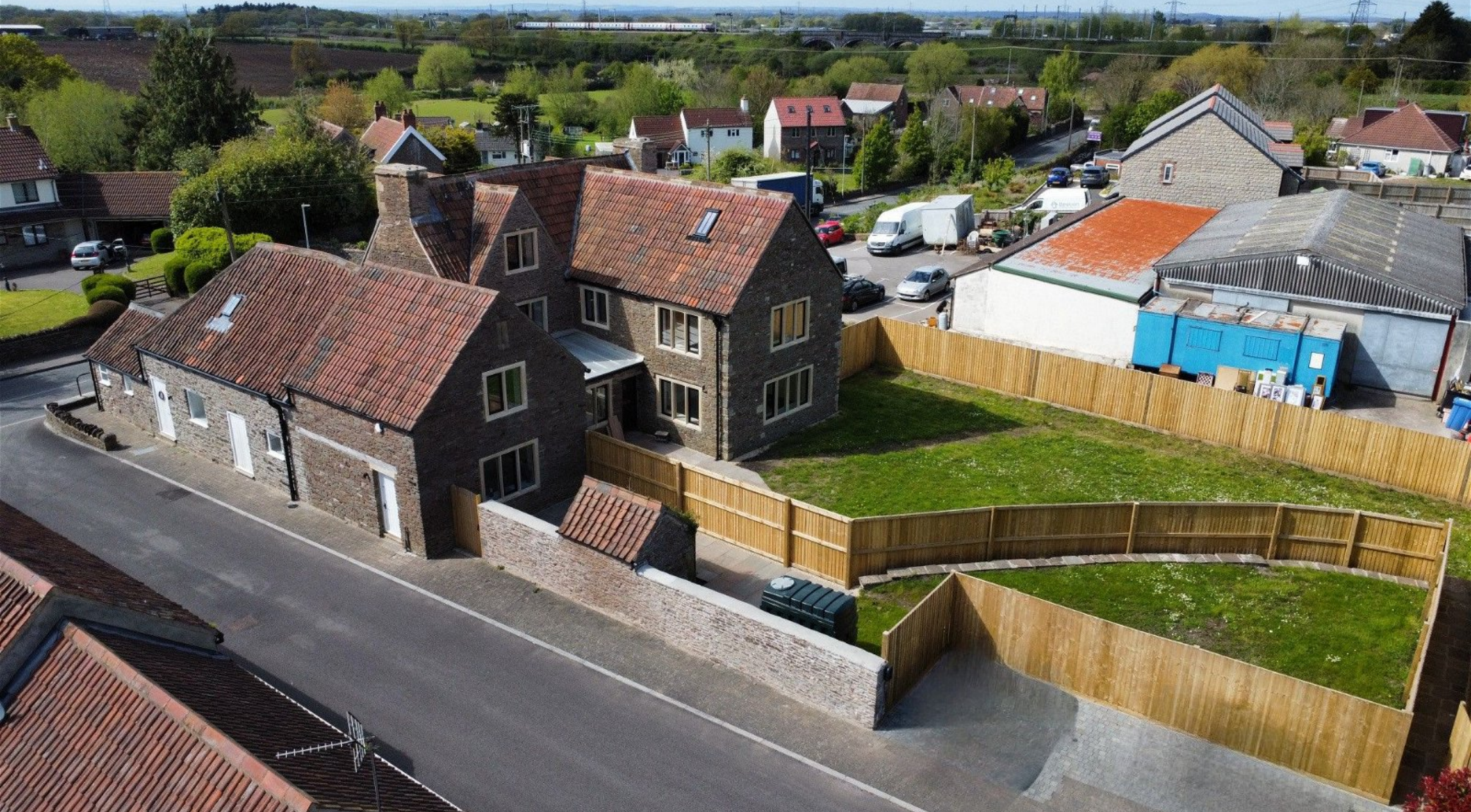
Carne Cottage, Brook Farm, Westerleigh