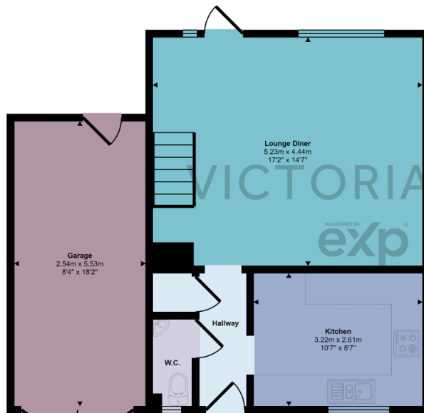
Ground Floor Approx 52 sq m / 565 sq ft

Approx Gross Internal Area 90 sq m / 974 sq ft