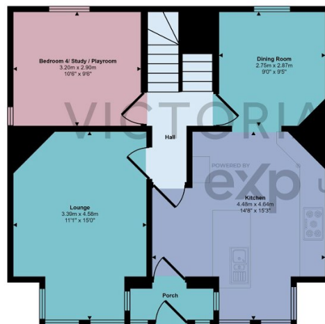
Ground Floor Approx 58 sq m / 620 sq ft