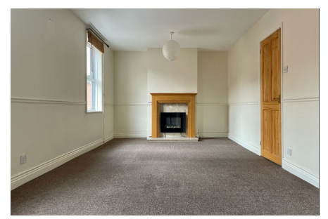
Please quote ref DS0168

Donna Smart Estate Agent is proud to bring to the market this two bedroom duplex apartment in the Centre of Tewkesbury.