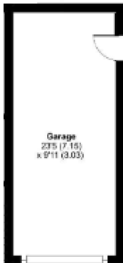
Garage 23'5" (7.15) x 9'11" (3.03)