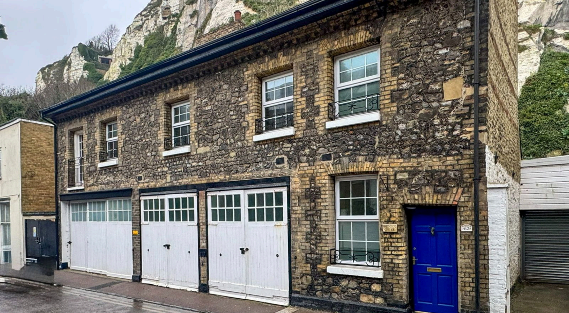
62, Arlington Cottage, East Cliff,