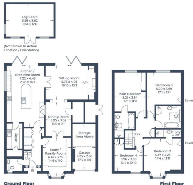
Illustration for identification purposes only, measurements are approximate, not to scale. © CJ Property Marketing Produced for EXP - Kate Woodward