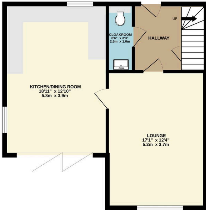
GROUND FLOOR 557 sq.ft. (51.8 sq.m.) approx.