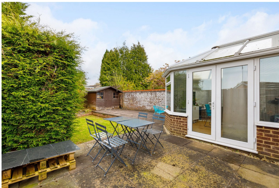
Hillside Close, East Grinstead Approximate floor area 135.7 sq m/ 1461 sq ft