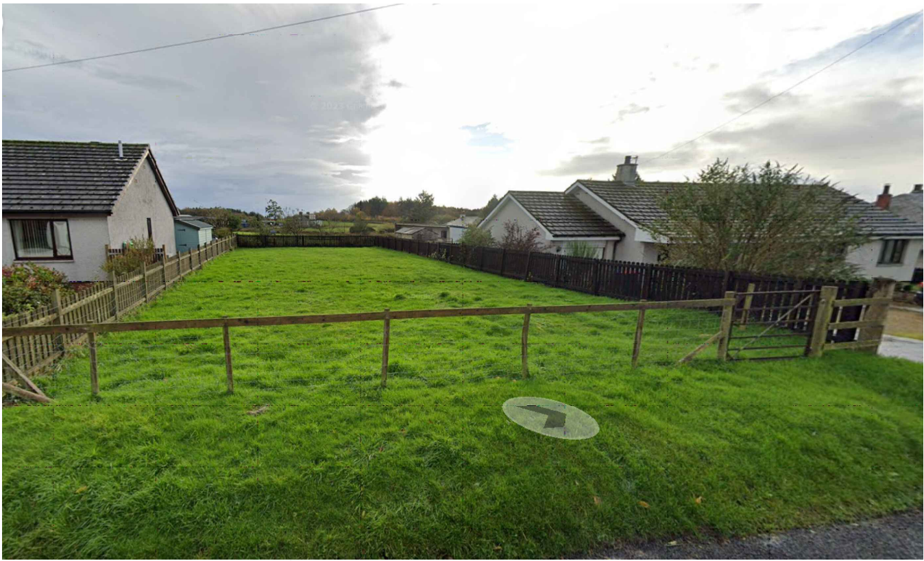
Existing Site Photo

Notes: Car Parking In curtilage parking with comprising space for 3 cars Siting and Design Indicative house layout indicated only. Proposed house sits in line with existing houses in row and to a scale and size reflective of the existing character of properties to left and right of site and the existing dwellings. The site level would be similar to 'Ashleyn' house the adjacent property. Design intended for further application would be a single storey, sustainable and low carbon dwellinghouse in timber frame construction. The indicative layout would be developed further subject to AMSC application conditions. Services Connection to existing sewage system