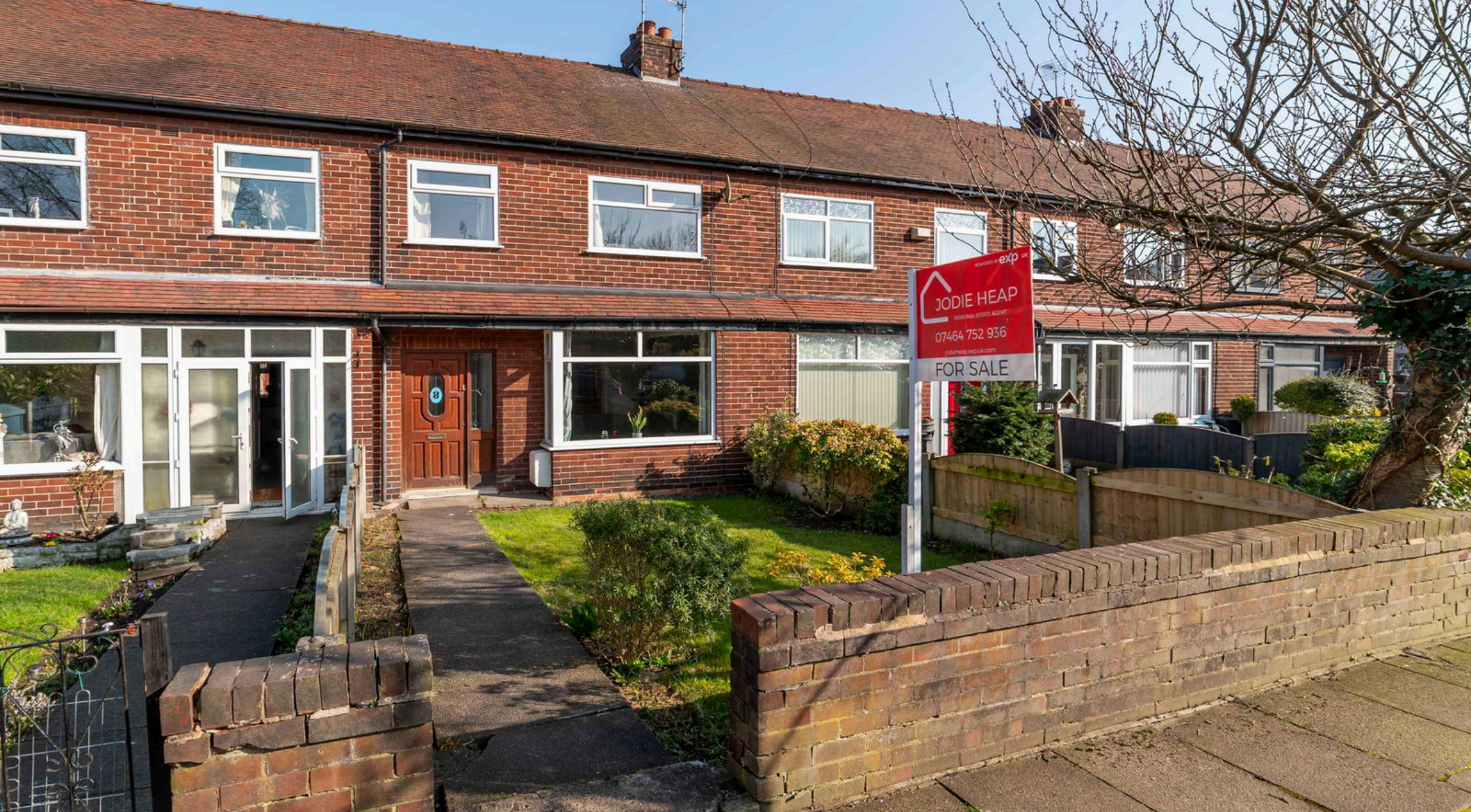
Melton Close, Heywood