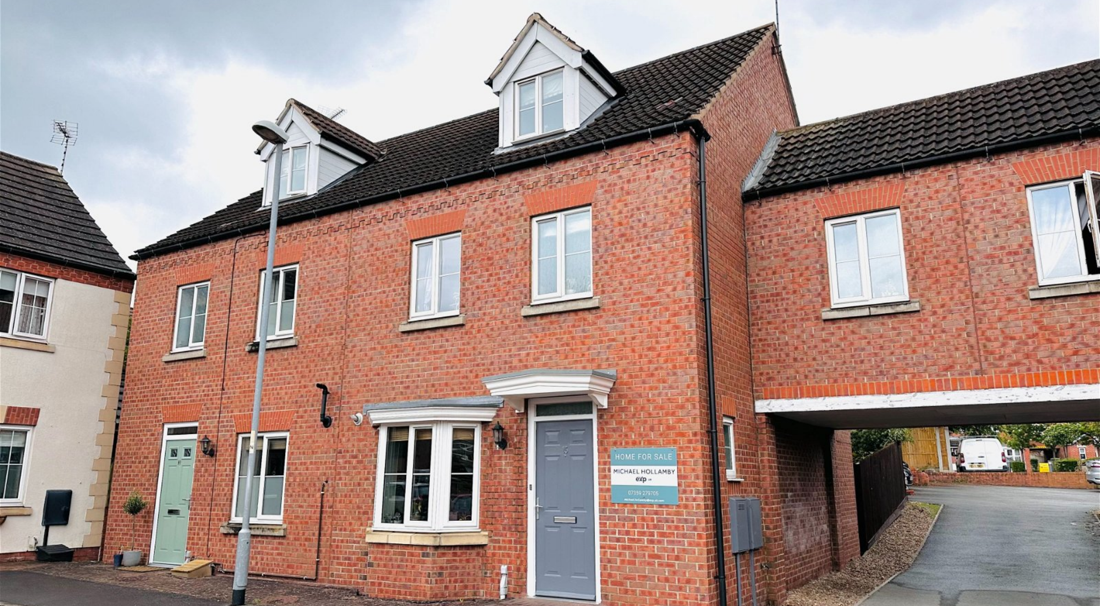
Dorrigan Close, Lincoln, LN1 1AT