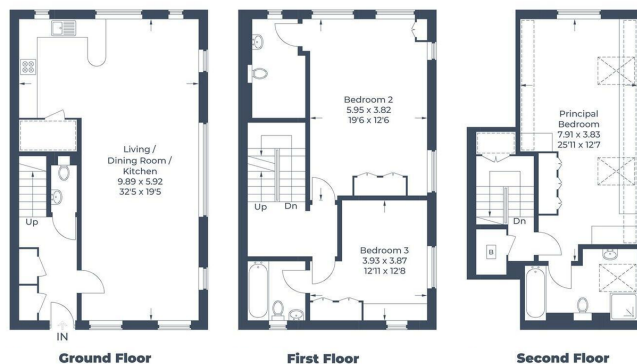
Illustration for identification purposes only. measurements are approximate, not to scale.

Approximate Gross Internal Area Ground Floor = 58.5 sq m / 630 sq ft First Floor = 58.4 sq m / 629 sq ft Second Floor = 44.7 sq m / 481 sq ft Total = 161.6 sq m / 1,740 sq ft