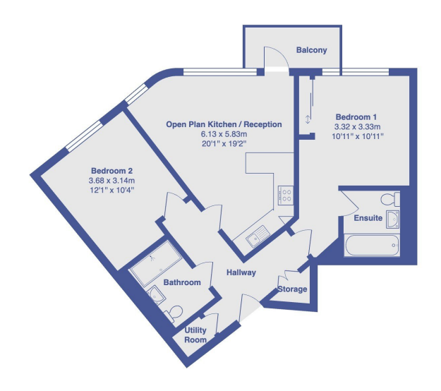
Thalia House, 4, Thunderer Walk, Woolwich, SE18 6BL Total Area: 70.7 m<sup>2</sup> ... 761 ft<sup>2</sup> (excluding balcony)