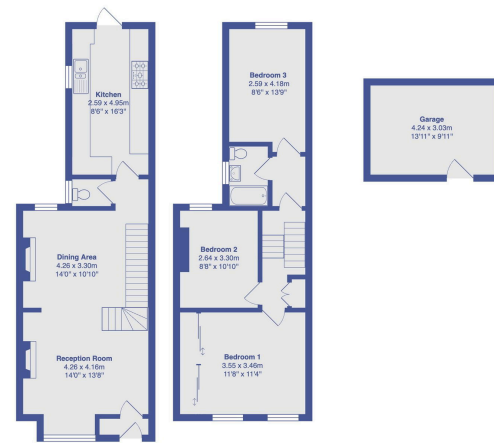
Abbey Grove, Abbey Wood, SE2 9EU Total Area: 101.3 m 2 ... 1090 ft 2 All measurements are approximate and for display purposes only