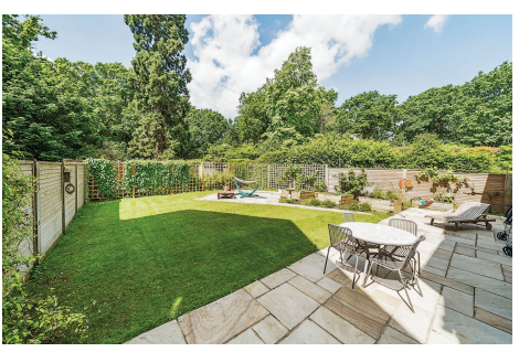
Flat 2, 1, South Hill Road Guide Price £850,000