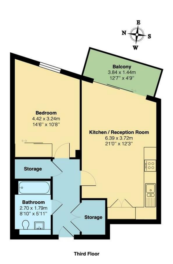
Total Area: 52.3 m^2\ldots 563 ft² (excluding balcony) All measurements are approximate and for display purposes only.

Please Quote Ref DG0640 - Guide Price £425,000 - £450,000. No Onward Chain. Embrace Modern Living in this Modern One-Bedroom Apartment with Balcony, Concierge and Residents Gym by the Canal.