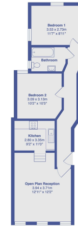
Flat 1, 38, Floyd Road, Charlton, SE7 8AN Total Area: 63.0 m 2 ... 678 ft 2 All measurements are approximate and for display purposes only