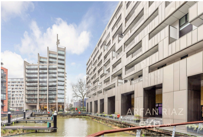
Woods House, Gatliff Road, London, SW1W

APPROX. GROSS INTERNAL AREA: 45.1 m 2 ... 485 ft 2