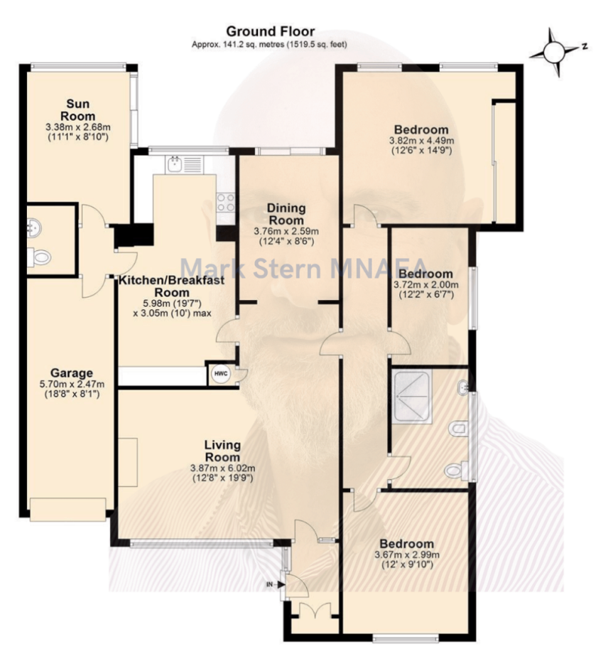
Total area: approx. 141.2 sq. metres (1519.5 sq. feet)