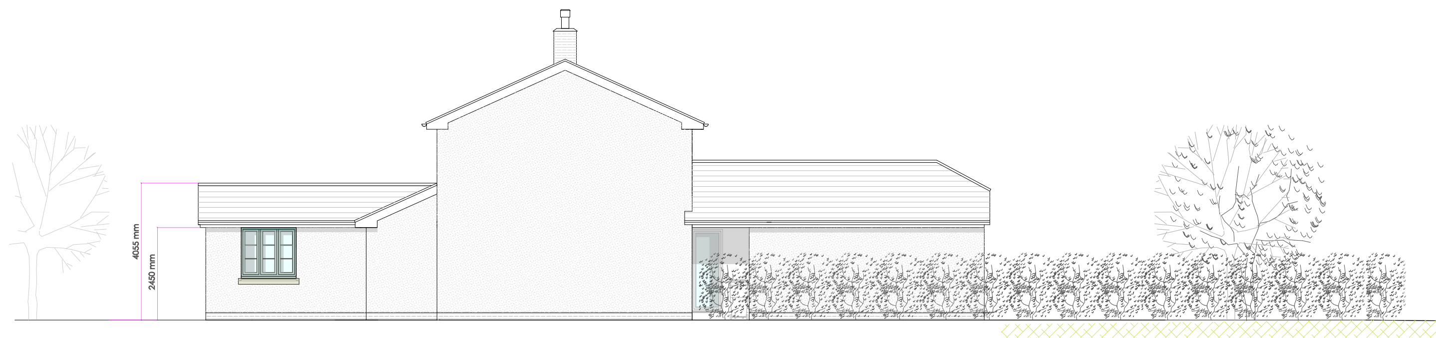
SIDE (EAST) ELEVATION