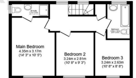
First Floor Floor area 46.3 sq.m. (499 sq.ft.)

Total floor area: 153.7 sq.m. (1,655 sq.ft.)