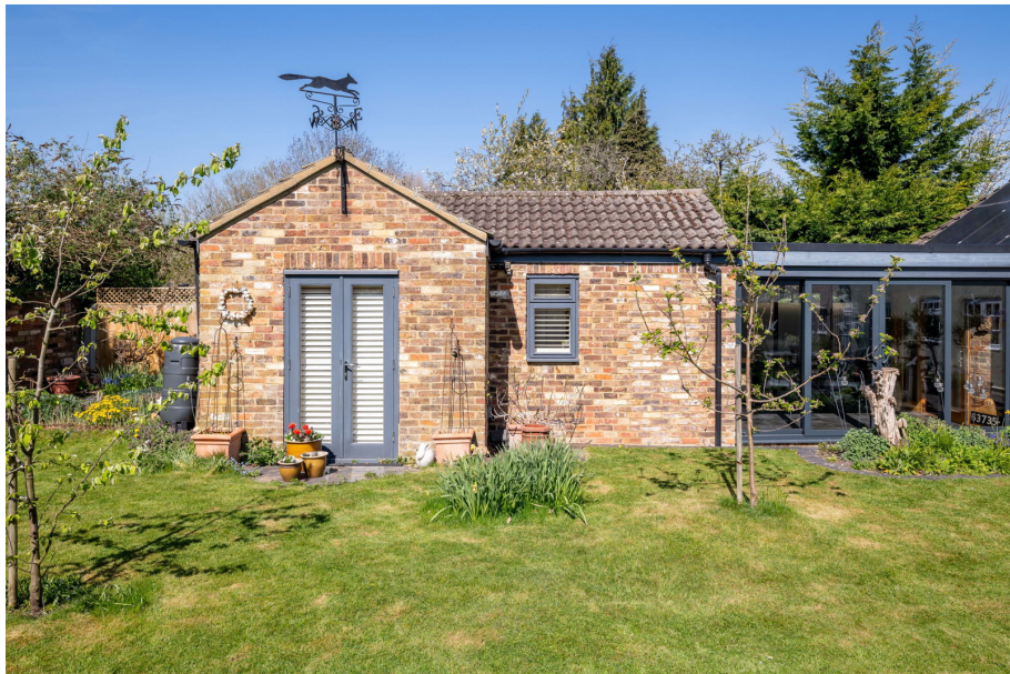
Jon-Paul Brampton presents...The Old Bakehouse & Garden Room Annexe - period charm in picturesque Pitstone.