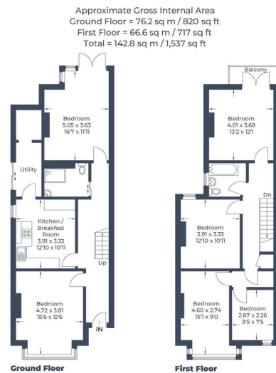
Illustration for identification purposes only, measurements are approximate, not to scale. © C3 Property Marketing Produced for Boudicas