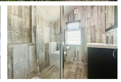
Charming Period Terraced Home in Denby - Refurbished to Perfection!

Welcome to your dream home! Nestled in the ever popular location of Denby, this pristinely presented period terraced property has been thoughtfully refurbished to the highest standards and is ready for you to move in with no upward chain to consider. Offering spacious room sizes throughout and including fabulous features such as a log burner for those cosy winter nights, bespoke hand made solid wood internal doors and newly fitted kitchen and bathroom, this is one to definitely view!