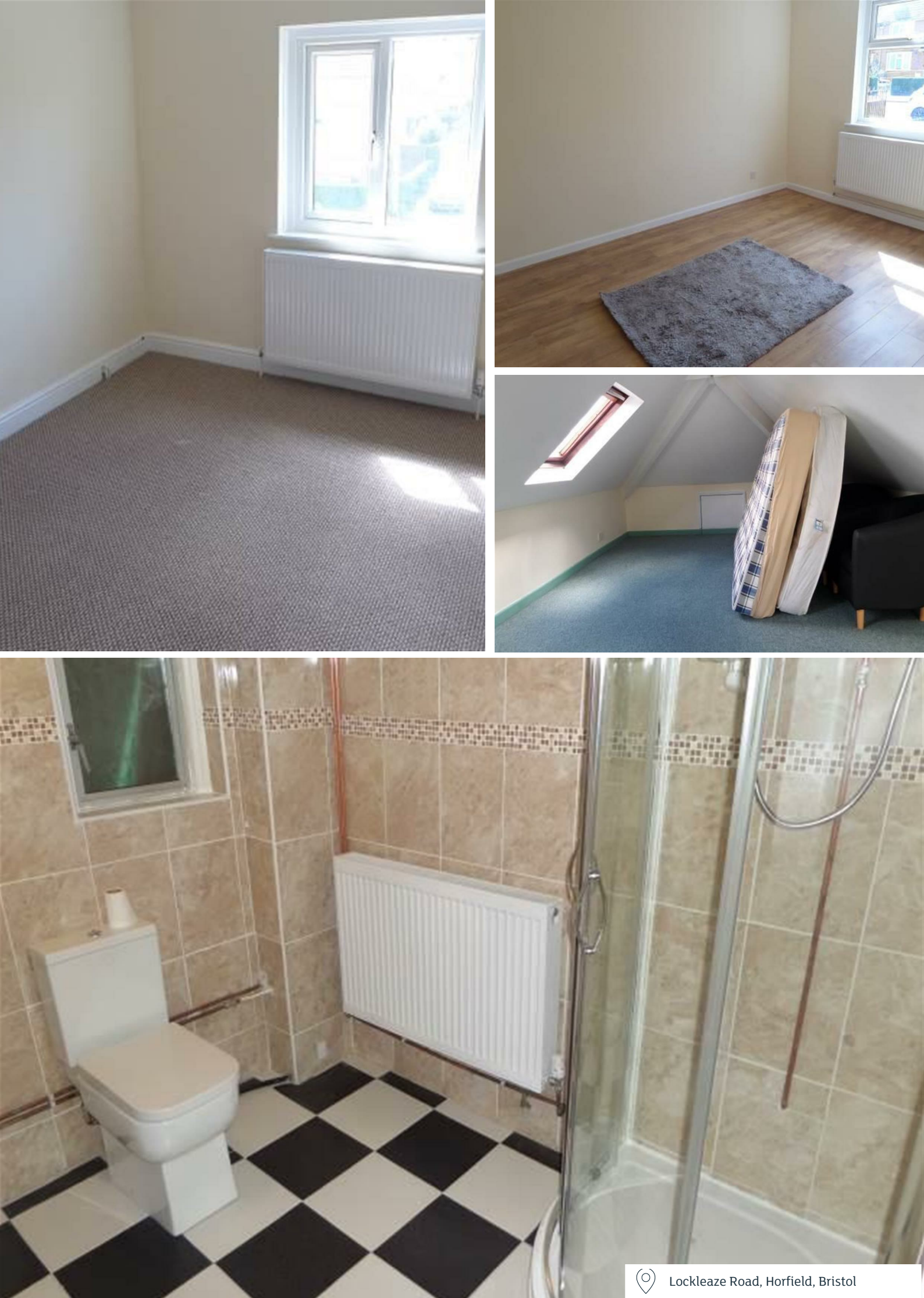
Lockleaze Road, Horfield, Bristol