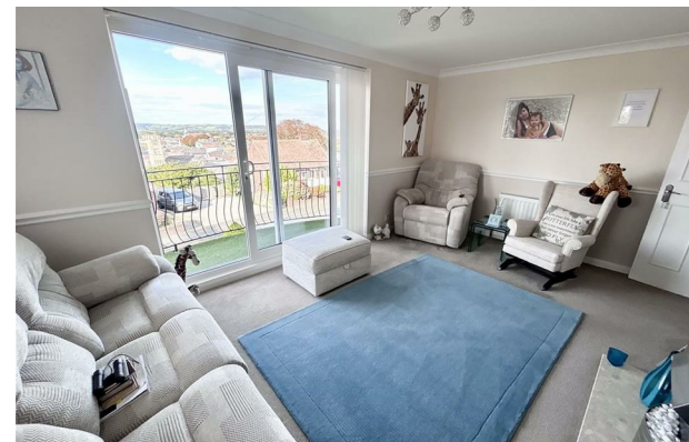
▼ Ground Floor