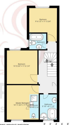
▼ 1st Floor

THIS FLOOR PLAN IS FOR INFORMATION ONLY. RED SQUIRREL PROPERTY SHOP DISCLAIMS ANY WARRANTY INCLUDING, WITHOUT LIMITATION, SATISFACTORY QUALITY OR ACCURACY OF DIMENSIONS.