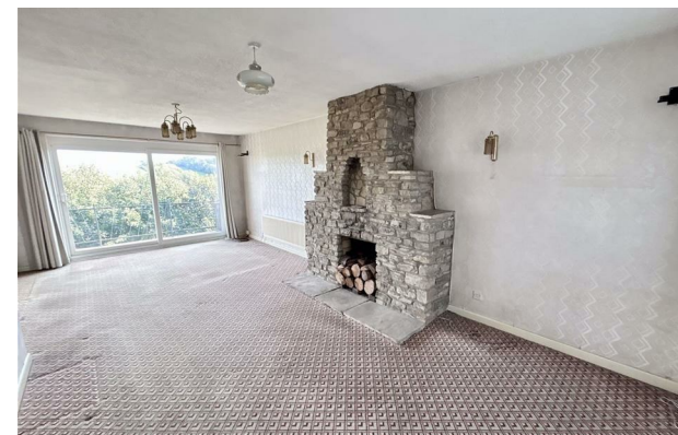
▼ Ground Floor