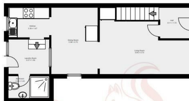
▼ 1st Floor