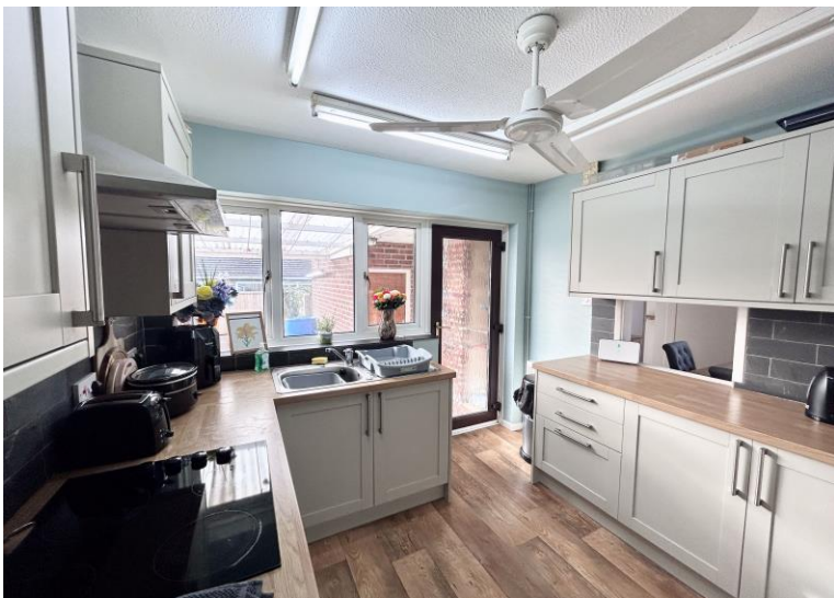
Address: 1 Elizabeth Gardens, Havenstreet, RYDE, PO33 4DU RRN: 9225-3034-3202-9504-8200

While every attempt has been made to ensure the accuracy of the floorplan contained here, measurements of doors, windows, rooms and any other items are approximate and no responsibility is taken for any error, omission or misstatement. This plan is for illustrative purposes only and should be checked on site for any prospective purchaser. The services, systems and appliances shown here will be tested and no guarantee as to their operability or efficiency can be given. Made with Metropix ©2024