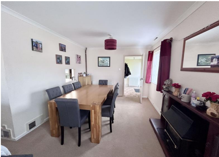
Address: 1 Elizabeth Gardens, Havenstreet, RYDE, PO33 4DU RRN: 9225-3034-3202-9504-8200

While every attempt has been made to ensure the accuracy of the floorplan contained here, measurements of doors, windows, rooms and any other items are approximate and no responsibility is taken for any error, omission or misstatement. This plan is for illustrative purposes only and should be used as a guide for any prospective purchaser. The services, systems and appliances shown here will be tested and no guarantee as to their operability or efficiency can be given. Made with Metropix ©2024