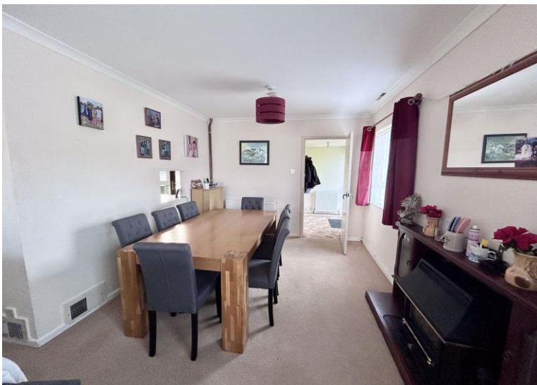
Address: 1 Elizabeth Gardens, Havenstreet, RYDE, PO33 4DU RRN: 9225-3034-3202-9504-8200

While every attempt has been made to ensure the accuracy of the floorplan contained here, measurements of doors, windows, rooms and any other items are approximate and no responsibility is taken for any error, omission or misstatement. This plan is for illustrative purposes only and should be used as a guide for any prospective purchaser. The services, systems and appliances shown here will be tested and no guarantee as to their operability or efficiency can be given. Made with Metropix ©2024