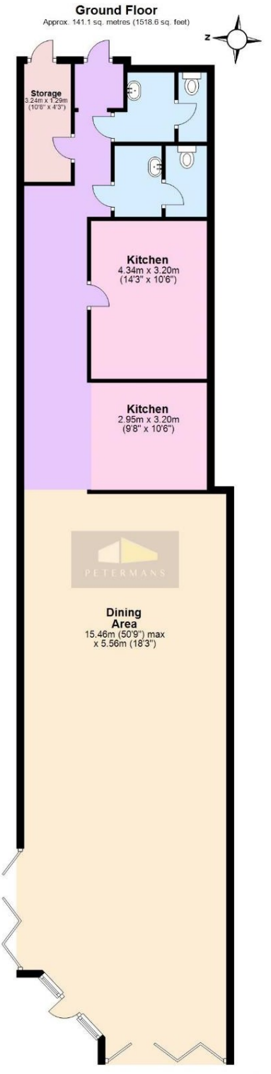
Total area: approx. 141.1 sq. metres (1518.6 sq. feet)