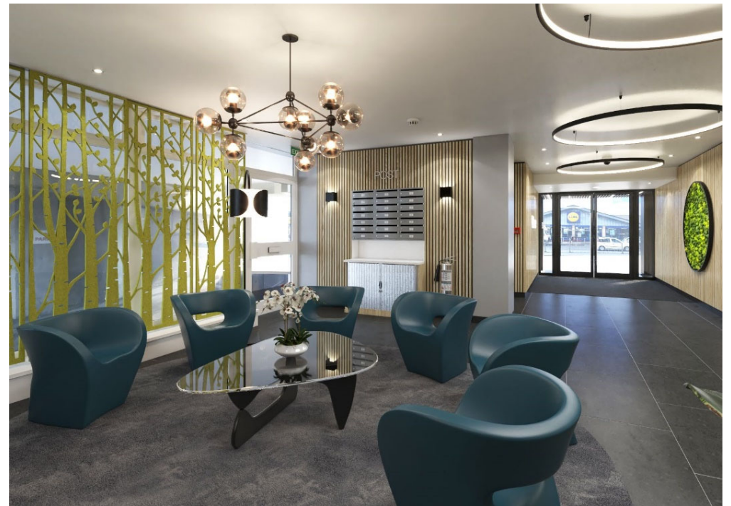
Concept new entrance